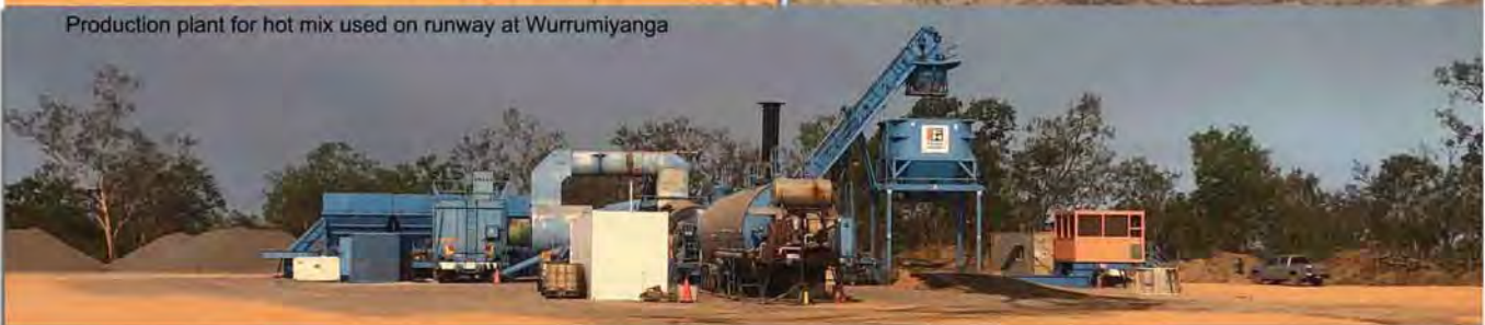
Production plant for hot mix used on runway at Wurrumiyanga