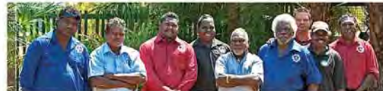
Tiwi Land Council Executive Management Committee