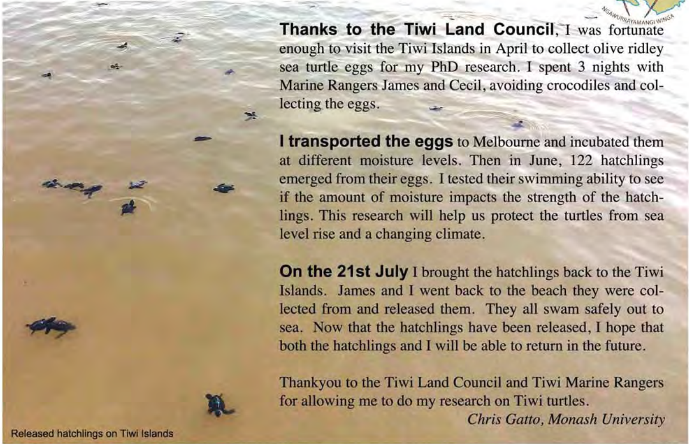
Released hatchlings on Tiwi Islands