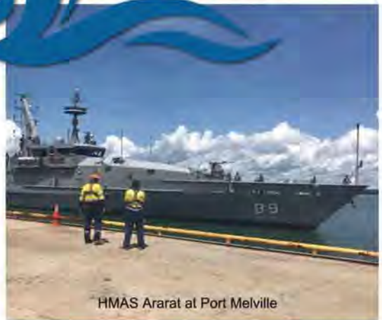
HMAS Ararat at Port Melville

As our operations have grown so has our team at the Port. We operate on a two team system with each team working back-to-back on a rotational basis thus ensuring we always have the required technical and other expertise at the ready. This personnel expansion has included appointing a dedicated Harbour Master and Pilot whose expertise ensures that our marine operations are to the highest standards of safety and efficiency; Bunkermen to ensure the provision of fuel to vessels and land customers is done safely and to required standards; maintenance and wharf personnel to keep our heavy plant, support equipment and the wharf - which is at the heart of our operations - is in the best of condition; Health Safety Environment and Quality personnel to make certain everything we do is safe for our personnel, contractors, visitors, the environment and Tiwi and; the all-important camp personnel who keep everything running.