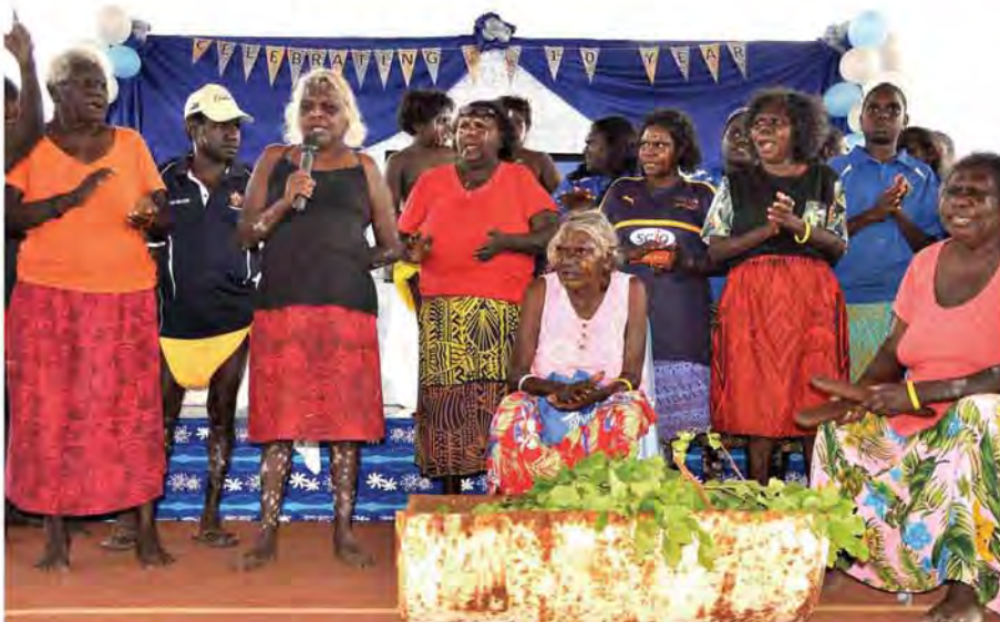
Celebrating 10th anniversary of Tiwi College at Pickataramoor in August