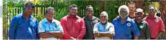
Tiwi Land Council Executive Management Committee

The dry season this year has been a great relief from the long Wet Season we experienced earlier in the year - giving everyone plenty of opportunity to head out bush to go hunting, camping, sitting by the beach and feeling happy with family.