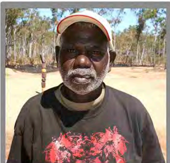
Tiwi Land Council Trustee of Mirrikawiyanga