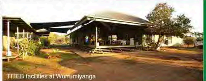
TITEB facilities at Wurrumiyanga