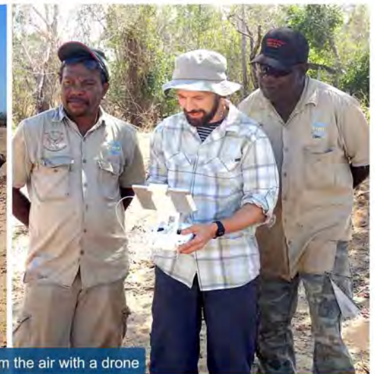
Taking pictures from the air with a drone