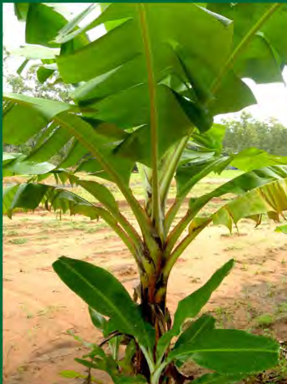
Healthy banana plants at Milikapiti Farm

It has been a long road since 2014, but thanks to the residents of Milikapiti, Milikapiti Farm staff and Tiwi Land Rangers, we may finally be rid of this serious disease.