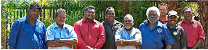
Tiwi Land Council Executive Management Committee