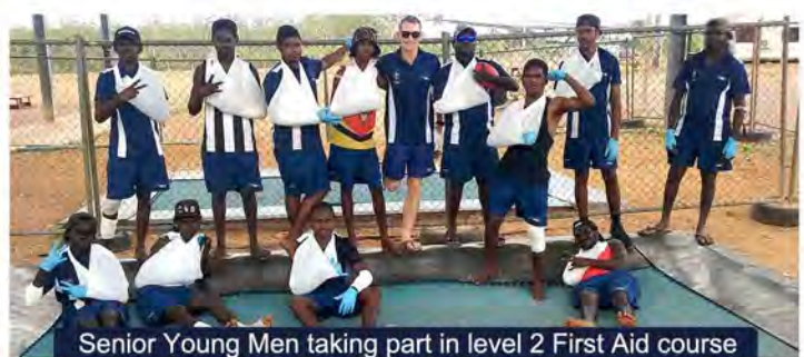
Senior Young Men taking part in level 2 First Aid course