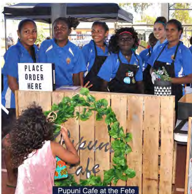
Pupuni Cafe at the Fete

The Family Group Homes are all coming together for their major event for the year, the School Fete. All members of the Tiwi Islands communities are invited to attend this event on 15th June. The students will be preparing food and drink, arts and crafts, fun activities and more to help make this day something you don't want to miss. Students will be donating a portion of their fundraising to a charity of their choice and using the remainder to make improvements to their Family Group Homes.