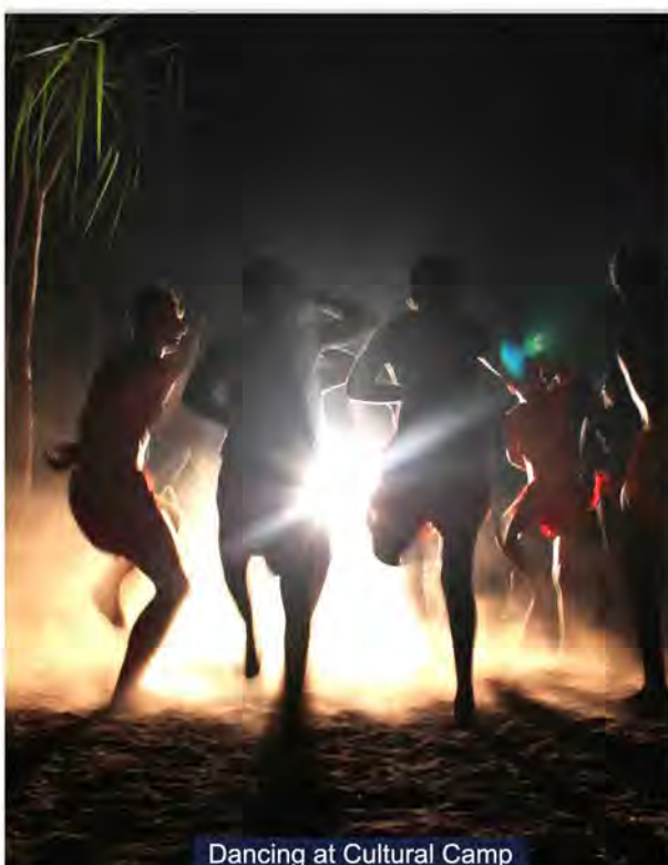
Dancing at Cultural Camp