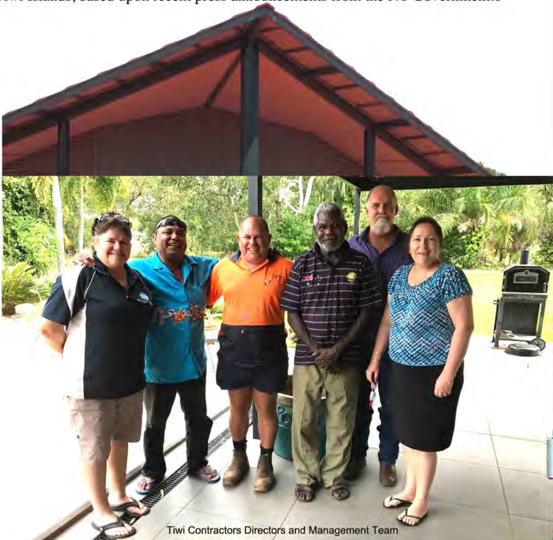
Tiwi Contractors Directors and Management Team