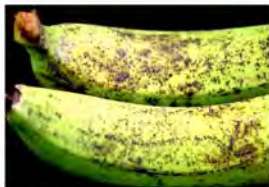
Banana freckle disease

Phase four runs from May 2017 onwards. Tiwi Land Rangers did the final inspection of sentinel plants on 3rd April, and sent the results to the NT Government. Rangers saw no sign of the disease, and if the NT Government agrees then they can say that it has finally been eradicated from Milikapiti.