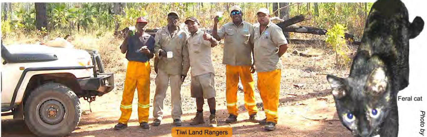
Tiwi Land Rangers