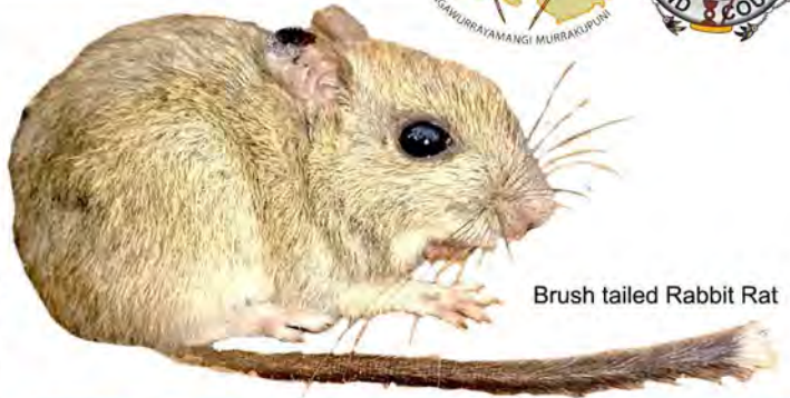
Brush-tailed Rabbit Rat