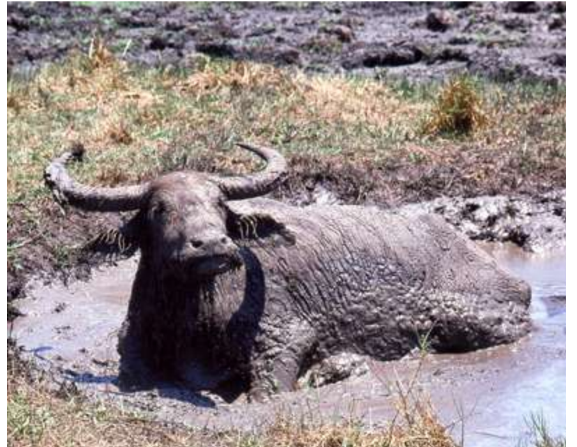
Feral buffalo wallows cause soil erosion and damage wetland areas important for hunting and collecting bush tucker.

Buffalo also carry serious cattle diseases including Lumpy Skin Disease, Foot-and-Mouth Disease, Bovine Brucellosis and Bovine Tuberculosis. Lumpy Skin Disease and Foot-and-Mouth Disease diseases are not yet in Australia but are currently in Indonesia and there is strong concern Lumpy Skin Disease could make it to the Tiwis, and then the mainland, by flies and mosquitoes carried on the wind. Bovine Brucellosis and Bovine Tuberculosis have been eradicated in Australia but could be accidentally reintroduced. These diseases pose a huge threat to Australia's livestock industries.