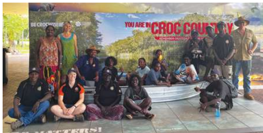
Tiwi students and guardians, rangers, IPA Committee members, and Tiwi Resources staff at the Territory Wildlife Park.