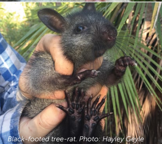
Black-footed tree-rat.