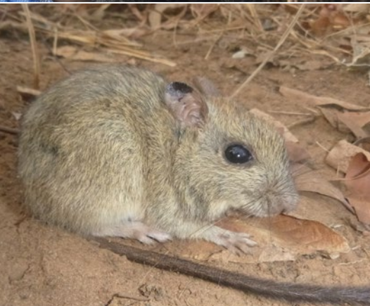
Brush-tailed rabbit-rat.